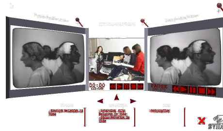
Fig. 2: presentation gadget